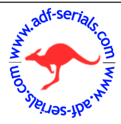
Updated 13th September 2005