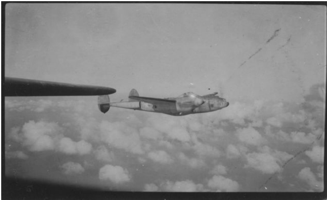
A war weary and Haze painted F4 41-2217 over PNG in late 1943.

The arrangement to supply three airframes was terminated on the 25 th May 1944 as a result of this.