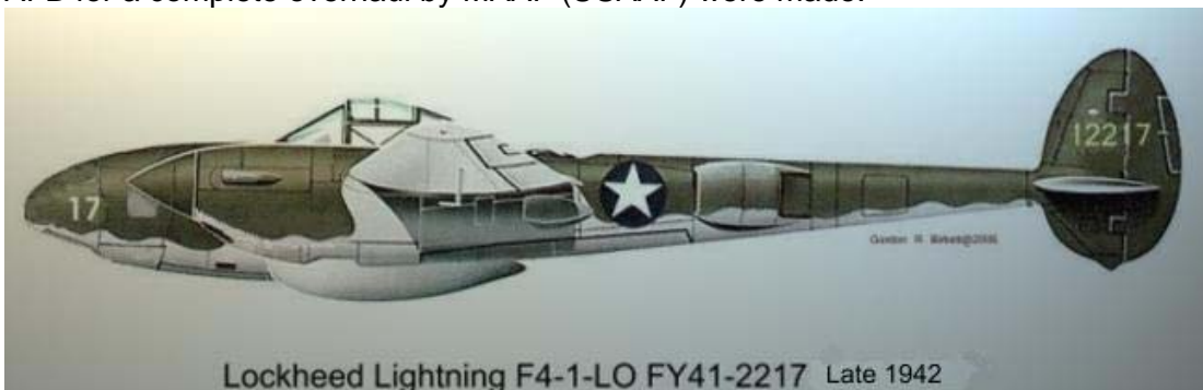
Lockheed Lightning F4-1-LO FY41-2217 Late 1942

Plans to make the trio flyable at Port Moresby for ferrying on the 30 th April 1944 to Amberley AFB for a complete overhaul by MAAF (USAAF) were made.