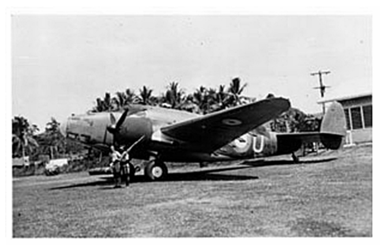
Pictured is A16-91 of 24Sqn's Hudsons at Rabaul late 1941. The remnants of No 24 Squadron crews and ground crews were evacuated by 11Sqn Empire flying boats in late January/early February 1942 to Australia.